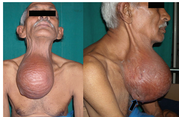
Figure 1. Pendulous goiter reaching to just above nipples, with skin edema and ulcer (arrow).

Under ultrasound guidance, a 12 F Mallecot catheter was inserted in the cystic cavity with drainage of approximately 150 ml of serous fluid, which reduced the size considerably. Under appropriate antibiotic cover, right hemithyroidectomy was done, with excision of a large redundant skin ellipse and neck muscles, and identification and preservation of the external branch superior laryngeal and recurrent laryngeal nerves, and the superior and inferior parathyroids. On naked eye examination, the surgical specimen revealed a normal