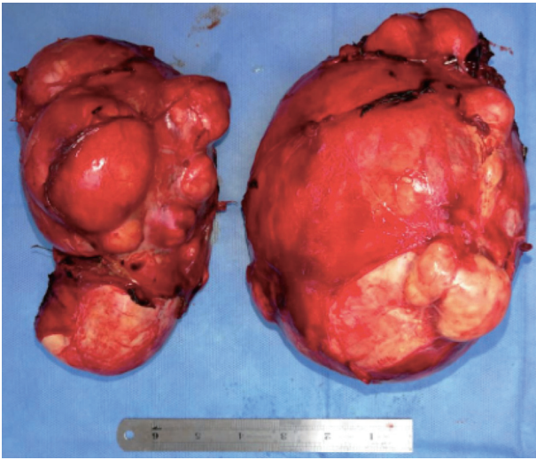
Figure 2. Gross pathology specimen showing bilateral lobulated, well-encapsulated adrenal tumor.

hardly found. Immunohistochemical stain for muscle-specific actin was positive. All these features are consistent with leiomyoma. The patient was recovered well postoperatively. He was maintained on low-dose hydrocortisone postoperatively and had no further episode of hypoglycemia observed.