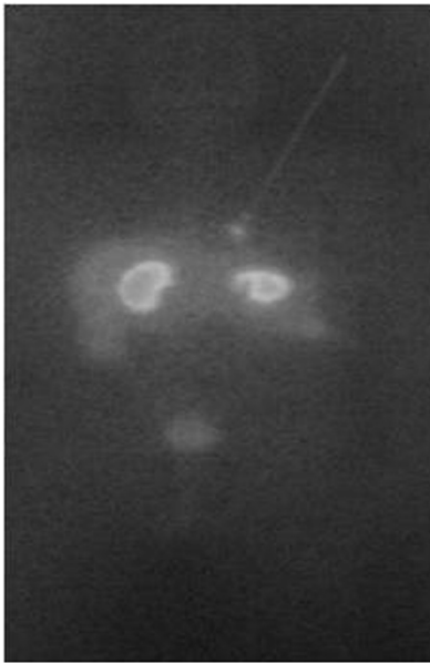
Figure 1. Octreoscan showing a single nodular lesion in the inferior third of the left hemithorax medial surface.

complaints and he was able to walk with the vest. There was a generalised cutaneous hyperpigmentation and increased CEA (9.2 ng/mL - reference range: < 5.0 ng/mL) and CgA (204 µg/L - reference range: < 100 µg/L) levels, although they were lower than those at initial presentation (CEA: 17.6 ng/mL; CgA: 1,473 µg/L).